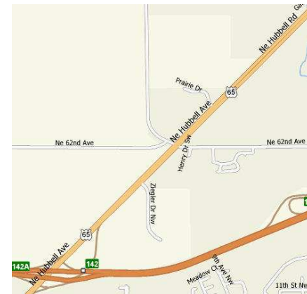
Hwy. 65, east of Des Moines