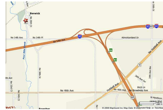
I-80, east of Des Moines