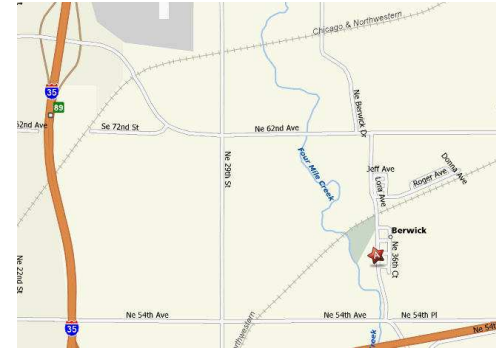
I-35, north of Des Moines