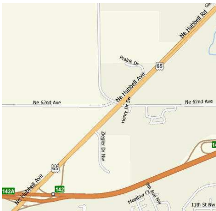
Hwy. 65, east of Des Moines